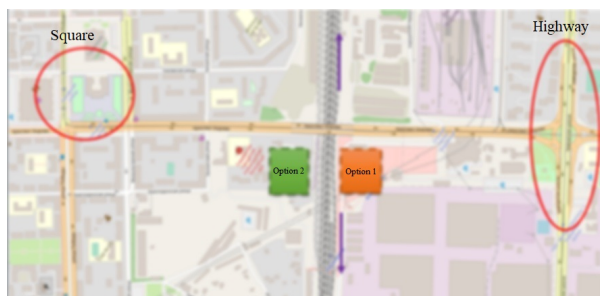
Figure 2: TPU placement options

To solve the problem of finding the optimal location, two possible options for the location of the TIH were selected. The first option for the location of the TIH was the option designed by the administration of the city district of Samara. In accordance with the plan, the TIH is planned to be located on the site of the existing market trade facility and next to the TIH station. With this location of the TIH and its construction, it will be necessary to demolish the Kirovsky market with its reconstruction and the organization of a suburban bus station. The strengths of this offer are the possibility of building a large intercept parking lot, the active use of a metro station, and the location within walking distance of one of the main highways. The options for placing the TPU are shown in Figure 2.